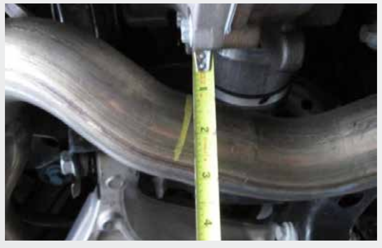
Mark the exhaust pipes in line with the rear differential cover plate. Make sure to mark a straight line with the angle of the exhaust pipe.