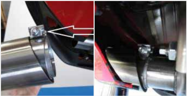
Slide the 3" band clamp onto the Vari-Tune exhaust tip with the bolt and nut facing towards the center of the vehicle and slide the Vari-Tune exhaust tip onto the outlet pipe of the BBK Vari-Tune muffler.