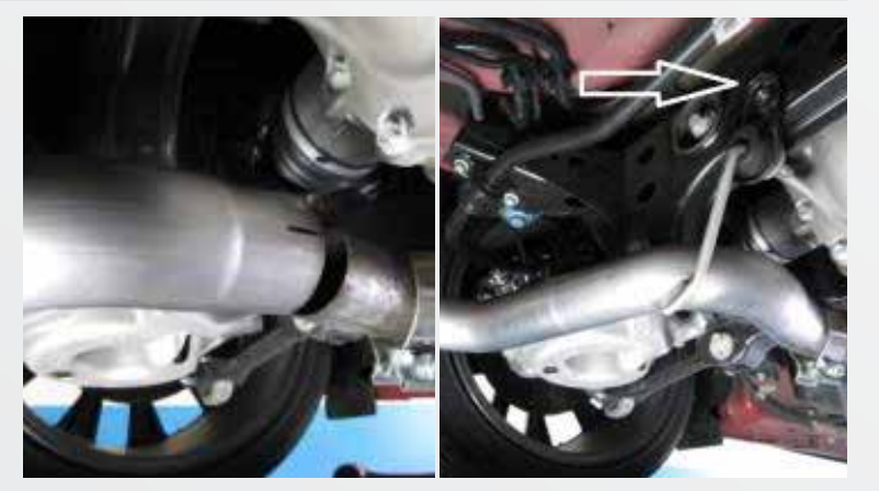
Slide the 2 <sup>1</sup>/<sub>2</sub>" band clamp and the BBK Axle Back tube over the stock exhaust pipe. Lift upward on the axle back tube and hook the exhaust hanger to the chassis.